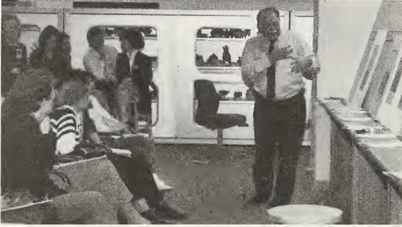
Oleg Grabar with students in the Arthur M. Sackler Gallery storage area, 1990